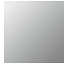
Aluminum Alloy A