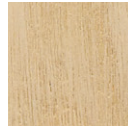
White Ash A2